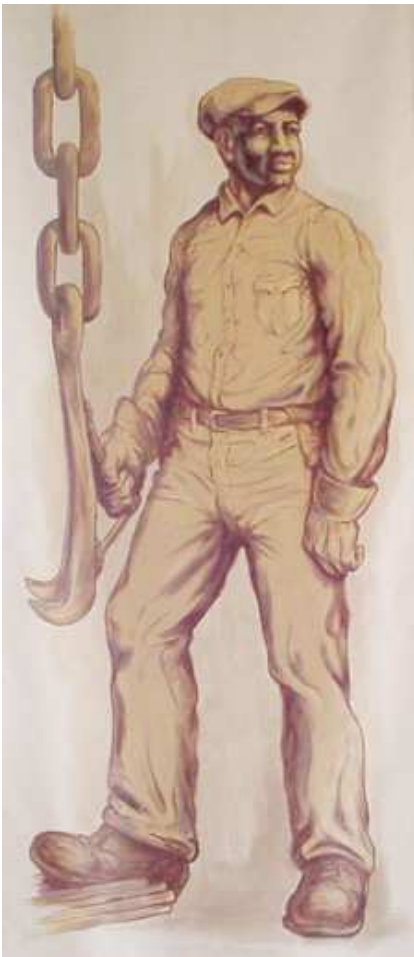
African-American worker loading steel plate, c. 1920