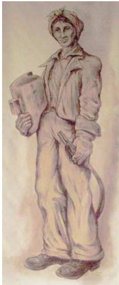
Woman worker in the mill, circa World War II, 1940s